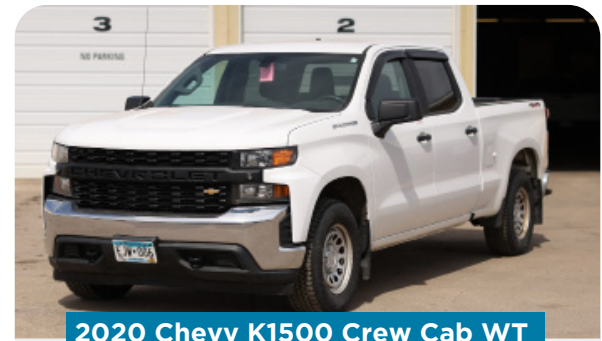
2020 Chevy K1500 Crew Cab WT

Deadline for submitting a bid is May 29, 2026