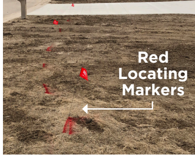
Red Locating Markers

If the markers are white and not red, they are representing proposed excavation. White markers can be used by anyone preparing for an excavation project. REA uses stakes with white ribbon, like pictured to the right. If you see these, they typically represent where we will be plowing in new underground or replacing old underground.