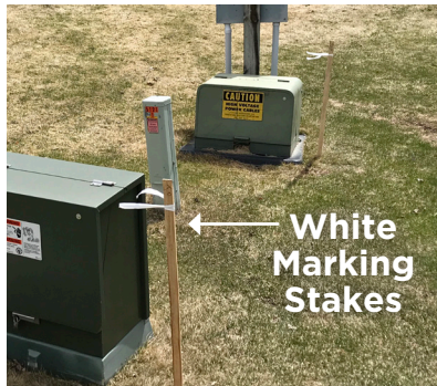
White Marking Stakes