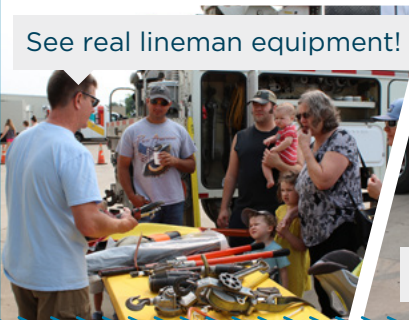
See real lineman equipment!