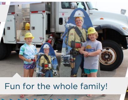
Fun for the whole family!