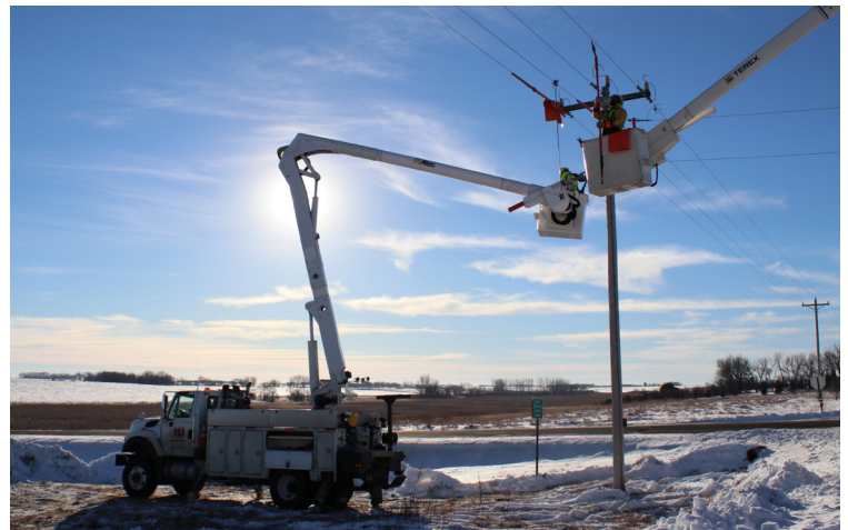
Work on REA's system continues year round.

Our budget process involves a look back at previous years and a forecast of what we expect to accomplish in the near future. Unfortunately, 2020 was full of challenges for us, but more importantly, all of you. This is not forgotten and we will continue to serve you with safe, reliable and affordable electricity.