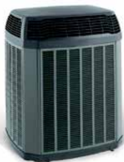
Air Source Heat Pump

Air Source Heat Pump Quality Installation Program Rebate: SEER 14.5: $480 • SEER 15: $580 • SEER 16+: $630