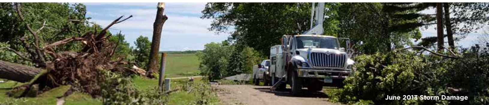
June 2013 Storm Damage

Please visit www.action.coop/ruralact to learn more and to show your support.