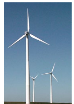
Wellspring Wind & Solar