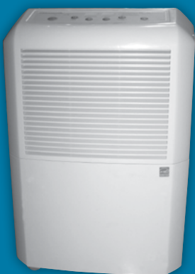
Air Source Heat Pump

COMBINE REA REBATES WITH HEAT PUMP EFFICIENCIES TO START SAVING TODAY!