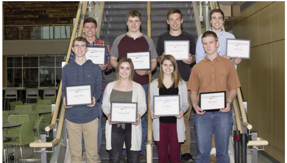
Congratulations our scholarship recipients and their parents. We wish you the very best!