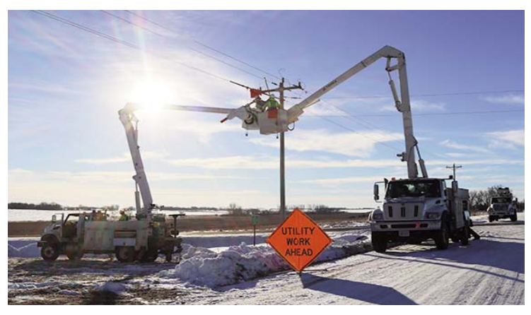
Help keep our linemen safe. Allow plenty of room for crews at work.

Thank you to all the members who attended our district meetings on January 22nd and 23rd. I thoroughly enjoyed the engagement with you, and we had great questions from the crowd. Congratulations to all of the nominated directors in District One and District Four (please see page 1). I love seeing our democratic process in action. I want to thank our members for their participation in their cooperative.