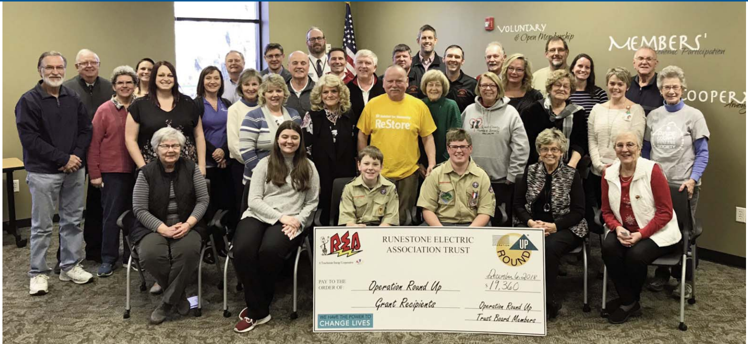
Christmas came early for thirty-eight organizations who shared $19,360 in grants from REA's Operation Round Up program in December. A complete list of grant recipients can be found at www.runestoneelectric.com . The deadline for the next round of funding is February 8. Application forms are available by calling Runestone Electric at (800) 473-1722 and can be downloaded at www.RunestoneElectric.com .